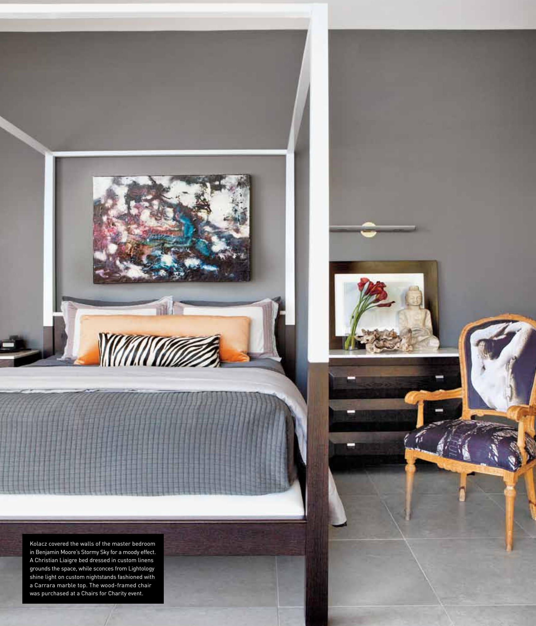
Kolacz covered the walls of the master bedroom in Benjamin Moore's Stormy Sky for a moody effect. A Christian Liaigre bed dressed in custom linens grounds the space, while sconces from Lightology shine light on custom nightstands fashioned with a Carrara marble top. The wood-framed chair was purchased at a Chairs for Charity event.